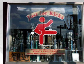
Former Just For Kicks' window sign in Dalton